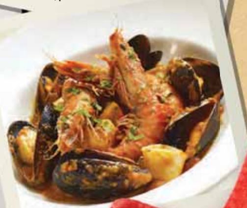
Asian Seafood Stew