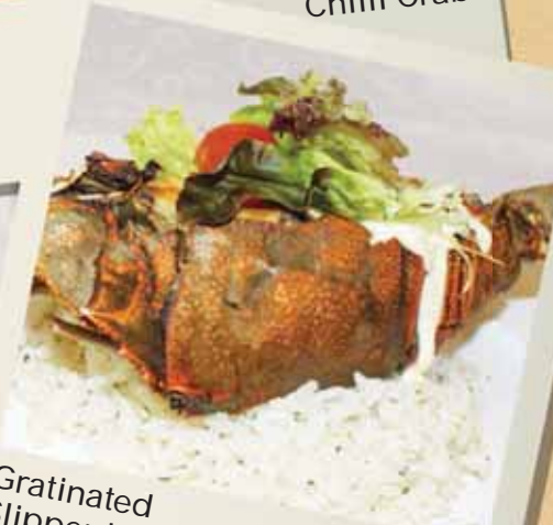
Gratinated Slipper Lobster Mushroom