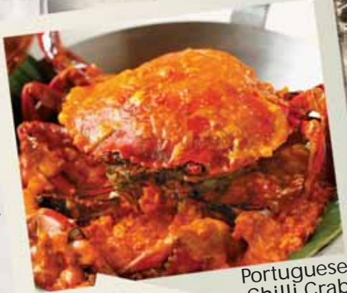
Portuguese Chilli Crab