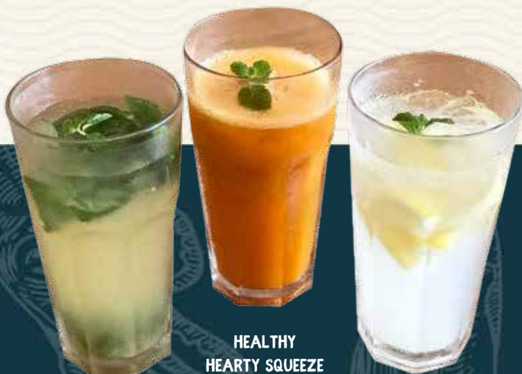
CITRUS HERB SURPRISE