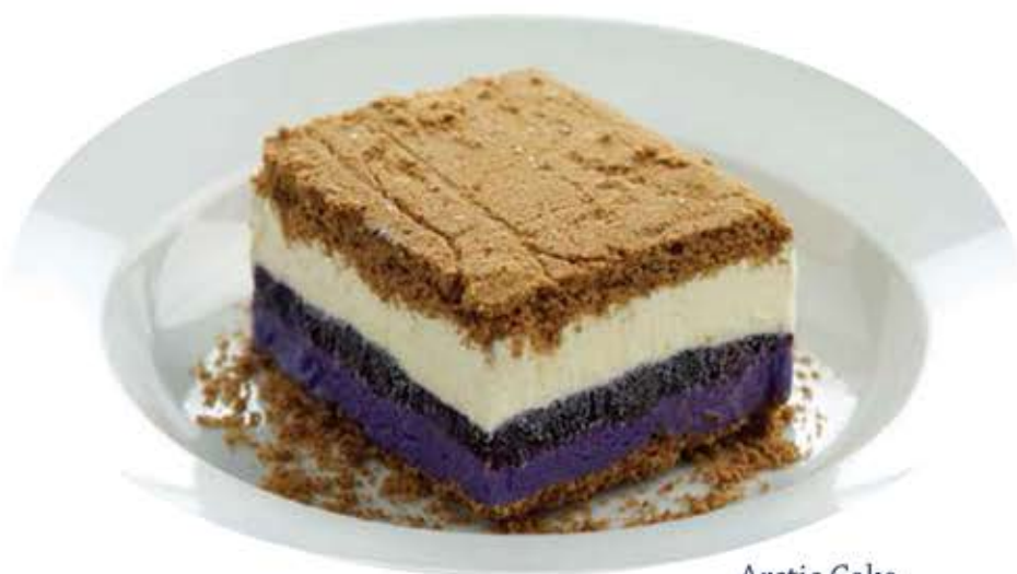
Arctic Cake Regular